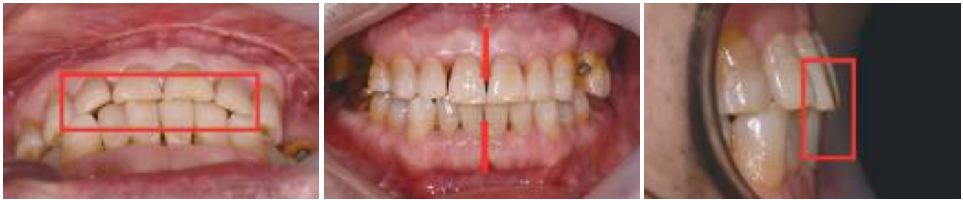
Fig. 8. Three months postoperatively, normal occlusion was restored (red squares). Also, note the correction of the midline shifting and canting of the maxilla (red arrows).