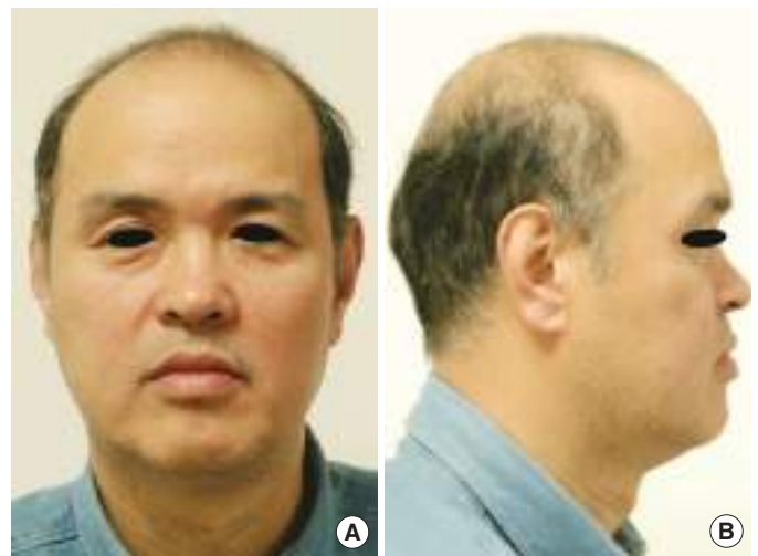
Fig. 6. Postoperative gross appearance of the patient at 3 months after surgery. Note the more convex contour of the midface and youthful appearance. (A) Frontal view and (B) lateral view.

traoral incision; a fracture line that was due to previous trauma was observed, and some drilling marks suspected as signs of improper reduction and internal fixation were also observed. After full mobilization of the maxilla through Le Fort I osteotomy, the lower segment of the maxilla was advanced to fit with preoperative wafers, and fixation was performed using a 2.0-mm titanium miniplates and miniscrews. After Le Fort I osteotomy, the bony gap on the left side was measured at approximately 3.0 mm. The author decided to perform bone graft. The cortical bone was harvested from the right mandible angle, inset to the bony gap, and fixed with miniscrews (Fig. 5). Alar flaring due to advancement of the maxilla was corrected using an alar cinching suture. Postoperative inter-