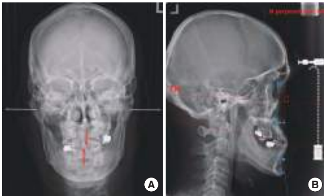
Fig. 2. Preoperative cephalometric analysis. FH to AB angle was larger than normal value. (A, B) Note the skeletal class III malocclusion, inadequate position of maxilla with depression, midline shifting (red arrows), and canting. A, A point; B, B point; FH, Frankfort horizontal; N, nasion.

status, and senile appearance due to depression of the maxilla and less visible incisor, and maxillary advancement with down through Le Fort I osteotomy was planned (Tables 1 and 2, Fig. 4). We excluded other surgical options such as Le Fort III osteotomy or two-jaw surgery by considering the above-mentioned factors. The surgical treatment objective was planned considering the elongation of the left side, impaction of the right side, and the correction of canting and midline shifting. Surgery was performed through in-