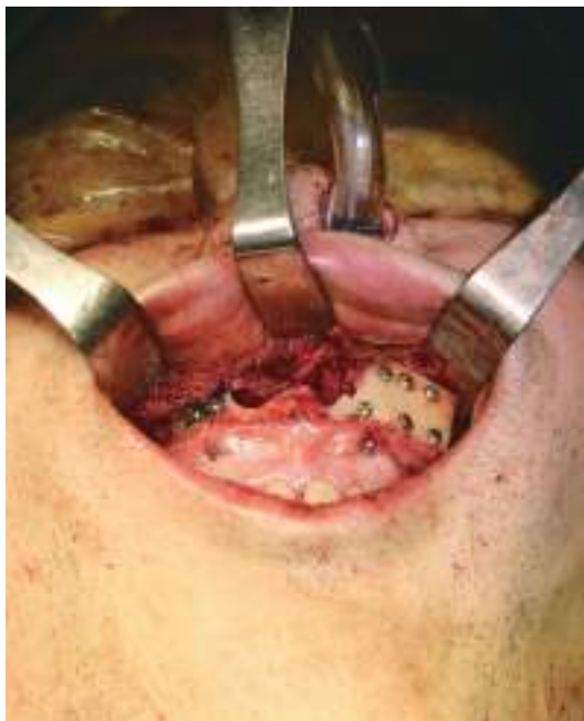
Fig. 5. The cortical bone was harvested from the right mandible angle, inset to the bony gap, and fixed with miniscrews.

traoral incision; a fracture line that was due to previous trauma was observed, and some drilling marks suspected as signs of improper reduction and internal fixation were also observed. After full mobilization of the maxilla through Le Fort I osteotomy, the lower segment of the maxilla was advanced to fit with preoperative wafers, and fixation was performed using a 2.0-mm titanium miniplates and miniscrews. After Le Fort I osteotomy, the bony gap on the left side was measured at approximately 3.0 mm. The author decided to perform bone graft. The cortical bone was harvested from the right mandible angle, inset to the bony gap, and fixed with miniscrews (Fig. 5). Alar flaring due to advancement of the maxilla was corrected using an alar cinching suture. Postoperative inter-