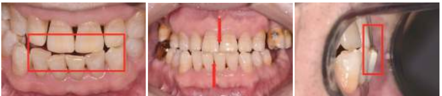
Fig. 3. Preoperative intraoral photography. Note the class III malocclusion, crossbite (squares), and midline shift (arrows) to left of the maxillary plane.

Le Fort I osteotomy with total advancement and midline correction to right. 3.34 mm advancement, 2.66 mm midline correction to right, 1.90 mm elongation based on upper left central incisor, 0.14 mm impaction based on upper right second molar, 0.88 elongation based on upper left first molar.