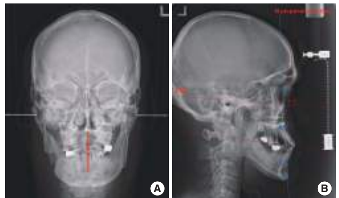
Fig. 7. Postoperative cephalometric analysis showed that the reference angles were closer to the ideal angles. (A, B) Note the correction of the midline shifting (red arrows). FH, Frankfort horizontal plane; N, nasion; A, A point; B, B point.

maxillary fixation was maintained for 4 weeks, and orthodontic treatment was not performed. Postoperative results were evaluated by gross appearance, cephalometric analysis, and postoperative intraoral imaging. The gross appearance of the patient did not have a dramatic effect but had more convex contour before surgery. As a result, senile-looking facial appearance became more youthful (Fig. 6). Postoperative cephalometric analysis showed that the reference angles representing relative mutual positions of the maxilla and mandible were closer to the ideal angles. Canting of the maxillary plane and midline shifting were also corrected (Fig. 7). Three months postoperatively, the patient returned to normal occlusion, and the patient reported subjective improvement of occlusion (Fig. 8).